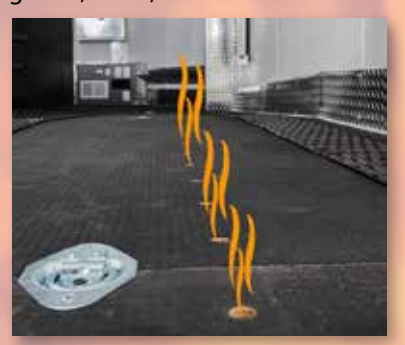
Forced Air Furnace with Track Melt System