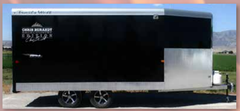
RPM 20 ft. BP with Gloss Black Skins and Silver Roof

©2017 Trails West Manufacturing of Idaho, Inc.