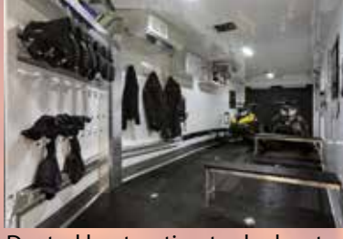
Ducted heat option to dry boots, gloves, coats, bibs and helmets