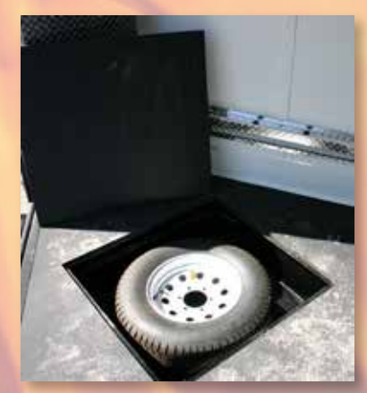
In Floor Spare Tire Storage