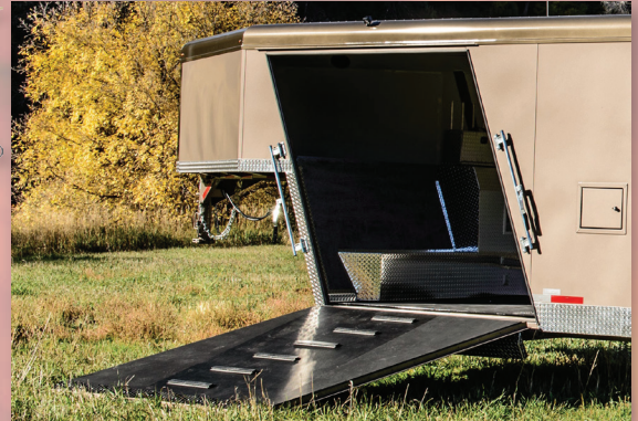
Standard Angled Side Ramp