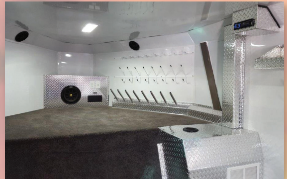
Ducted Heat Package