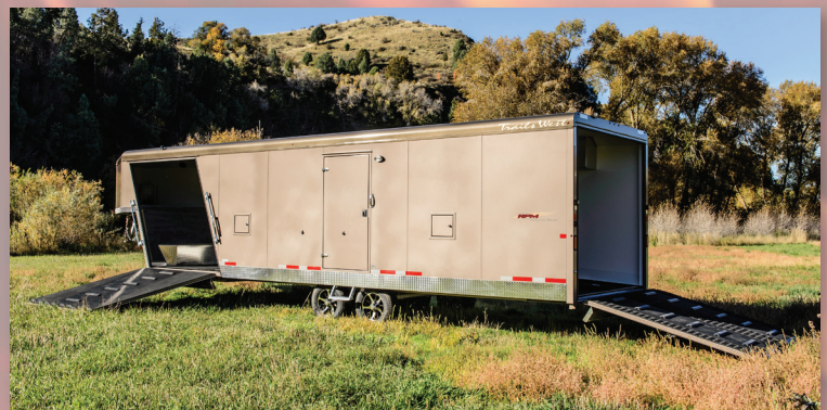
Non-Steep Ramp Angle